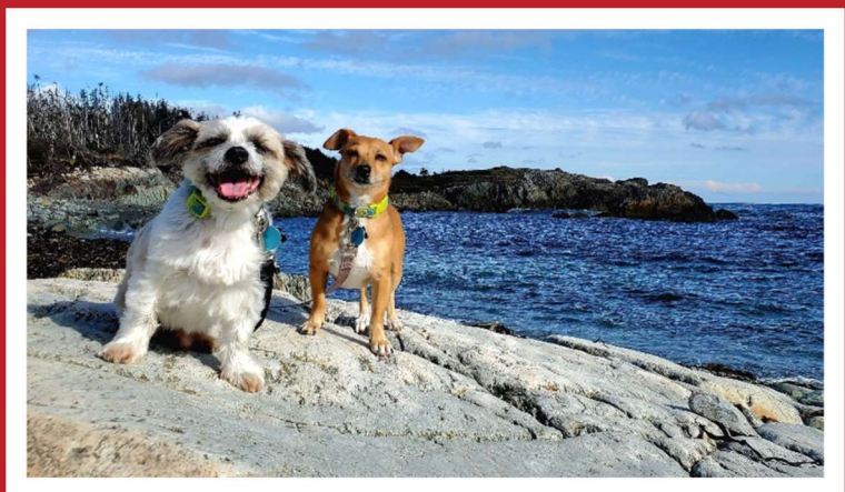
Sloan (14) & Romi (4), on the Louisbourg Lighthouse Coastal Trail