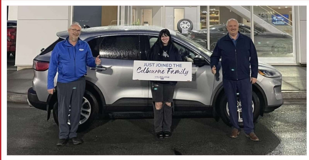
Em with their new wheels: a 2022 AWD Ford Escape!