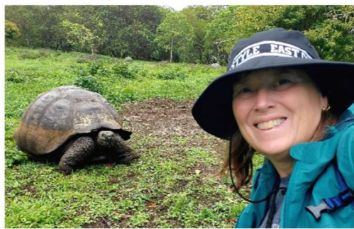
Me with a 150-year-old Galapagos Tortoise!

The highlights of my year were a "bucket list" retirement trip to the Galapagos Islands, and seeing whales in the wild at the top of the Cabot Trail.